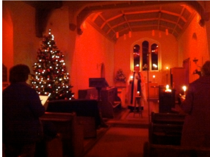
Christingle, January 2015.

Such was the success of the display, many asked if we could keep residents photographs of weddings and christenings, and other photographs of visits in the Church for a while longer, displayed amidst flowers on the window sills.