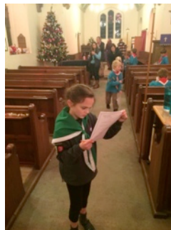
Treasured Times display December 2015: Youngsters visiting.

Using resources specially developed for the display, children of all ages explored the Church and its' history, with very successful visits from a local Beavers and Cubs Group, and a Home Education Club. Educational resources included a Quiz, An I-Spy activity, and imaginative game 'Through These Doors'; youngsters also contributed drawings, thoughts and stories about the church. Essex Archivist Allyson Lewis provided very helpful guidance regarding educational resources we may use in the future.