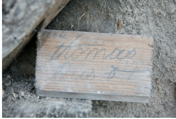
Plaque, St John the Evangelist Church, Essex.

Carved into the walls of the church are more marks from those who came before; in 1664, the initials 'MF' and historic graffiti from the 19th century. 'Who made these marks, and why? It's become like a detective story. We'd love to hear from any local historians who might be able to help.'