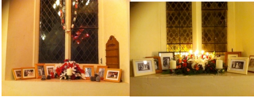
Treasured Times, villagers photographs amongst flowers and candles in window sills and at the font, December 2015.