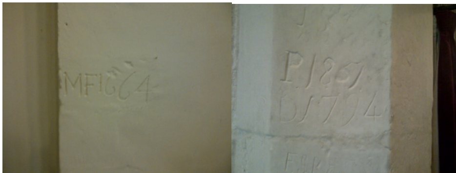
Graffiti, St John the Evangelist Church, Langley, Essex.

Carved into the walls of the church are more marks from those who came before; in 1664, the initials 'MF' and historic graffiti from the 19th century. 'Who made these marks, and why? It's become like a detective story. We'd love to hear from any local historians who might be able to help.'