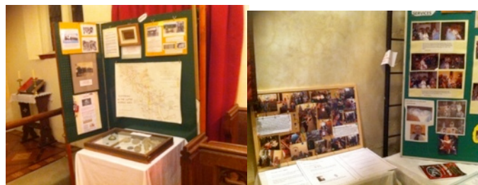
Treasured Times, screens and displays, December 2015.

Also available were Church archives and baptism registers dating from the 17th Century.